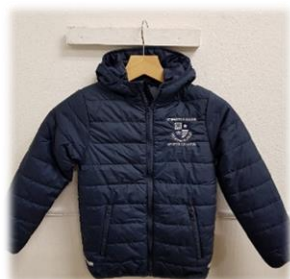
Padded Jacket (Compulsory)