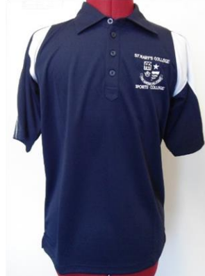
BOYS' PE Vapour Polo Shirt (Compulsory)