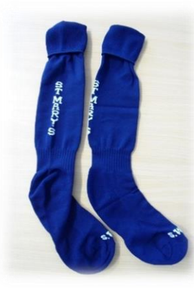
PE Socks (Compulsory)