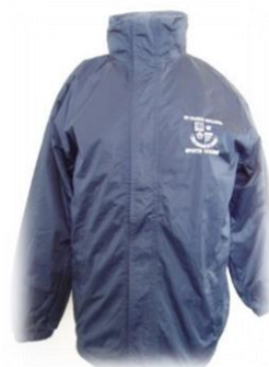
Reversible Coat (Compulsory)