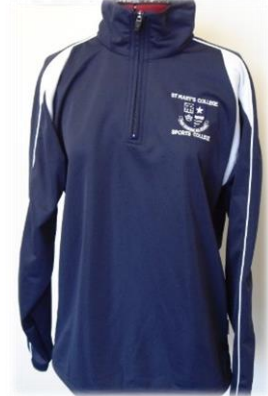
GIRLS' PE Cuatro Top