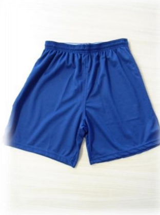
PE Shorts (Compulsory)