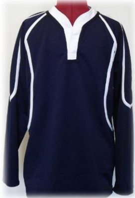
BOYS' Pro-Tec Rugby Training Shirt (Compulsory) (Compulsory)