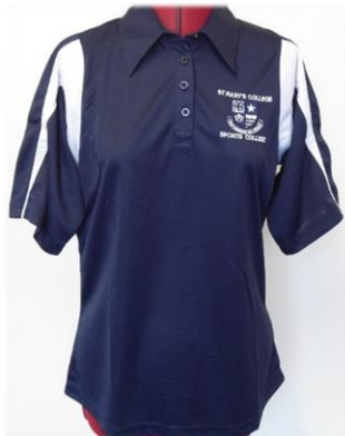
GIRLS' PE Haze Polo Shirt (Compulsory)